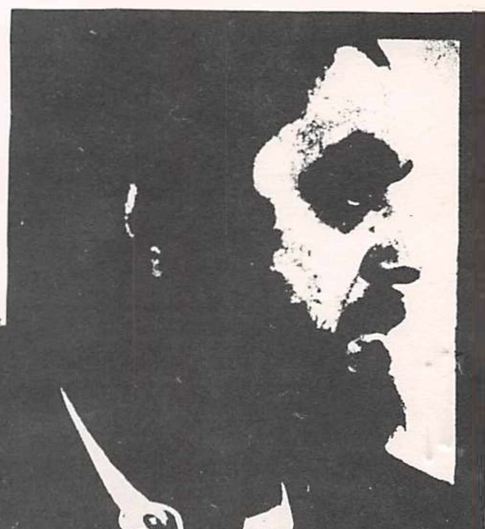
Director Stanley Kubrick.